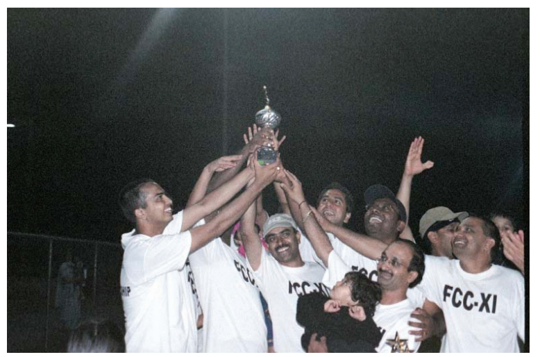
Triumphant FCC team with the trophy.

When the ninety odd players participated in the first-ever formal cricket tournament in central Pennsylvania, they had their eyes on more than just the red ball... they were playing to raise money for Sankara Eye Foundation. Organized by the Harrisburg Cricket Club (HCC), the tournament featured six teams from the region. Spanning seven weeks, the tournament saw each team play the others in a round-robin format. The top four teams got into the semi-finals. The semi-finals and the final were played under lights-a first in the region. FCC beat HACC XI in the first semi-final and Tigers got the better of Pak XI in the second.