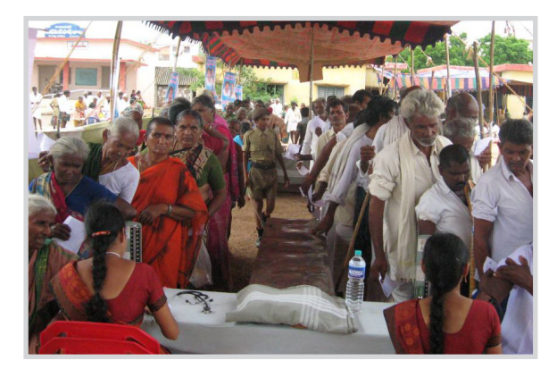
Mega Camp, Andhra Pradesh; Sept 14, 2013

The impact of our initiatives around preventative